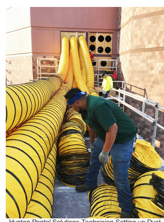
Hunton Rental Solutions Technician Setting up Duct

Call us today! Available 24/7 281-451-4273