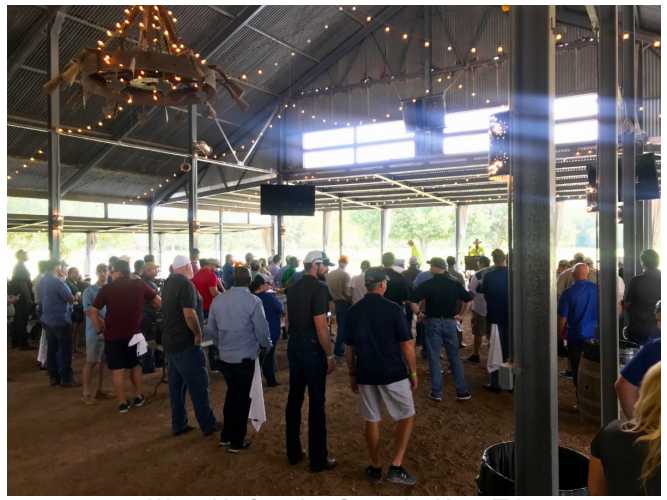
Westside Sporting Grounds- Katy, TX

On Wednesday, October 2nd, 2019, Hunton Services and Hunton Trane came together to participate as a platinum sponsor for the 9th Annual TAHFM Whack 'Em & Stack 'Em Clay Shoot. This event was organized to raise money for the Texas Association of Health Facilities Management. Teams participated in the tournament and networked throughout the event. The shooting was followed by awards, raffle prizes, and a delicious barbecue dinner.